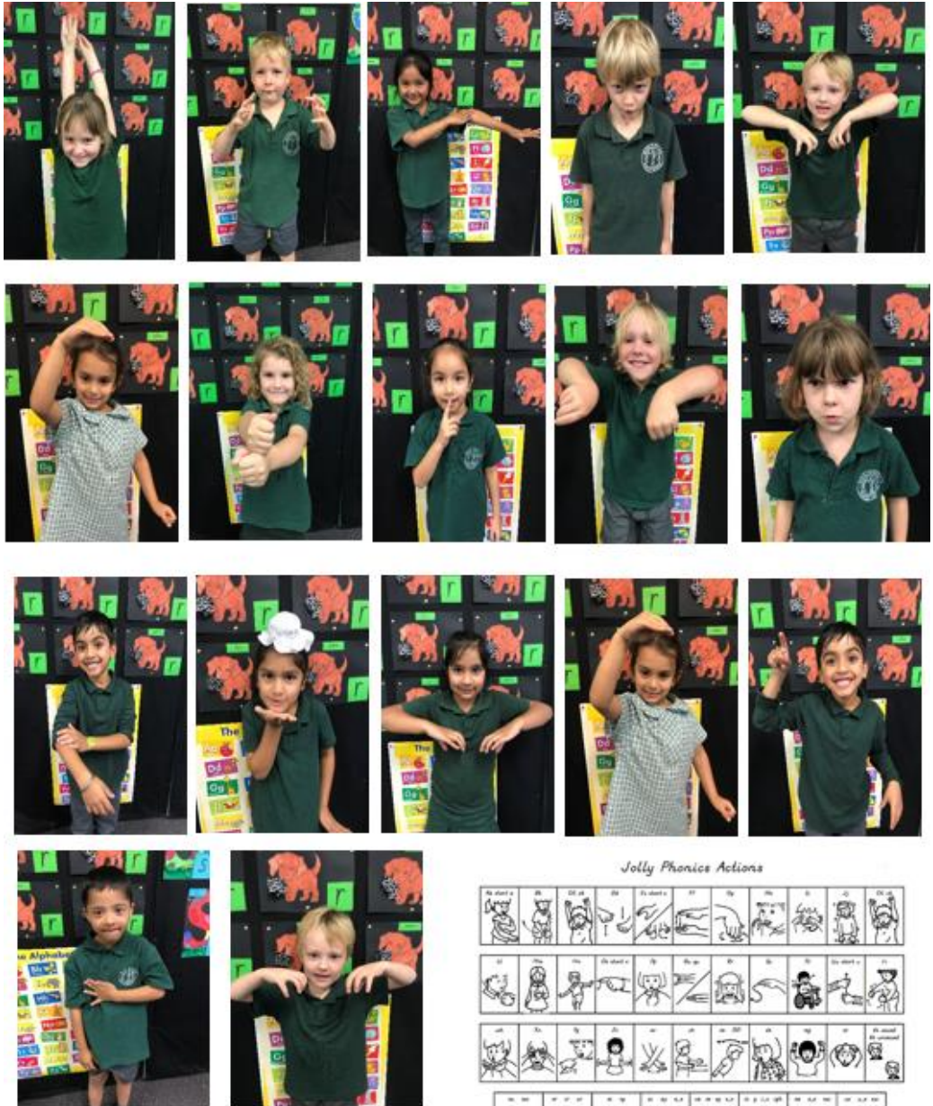
Jolly Phonics Actions

KF are using Jolly Phonics to create a secret message....can you crack the code?