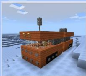
A Hagglund at Casey Station.