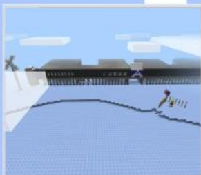
Scott Amundsen Station